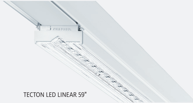
TECTON LED LINEAR 59"